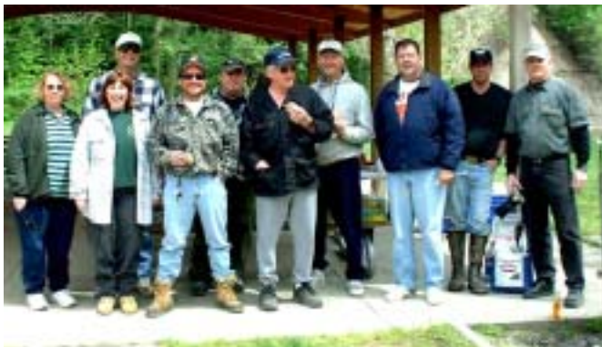
Volunteers from the Grand River Cleanup