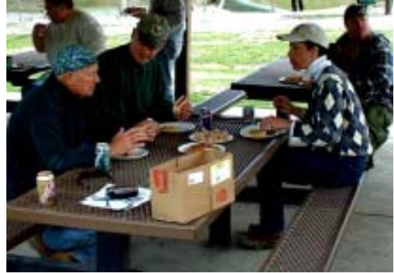
NCFE Volunteers enjoying lunch made by CRSA.